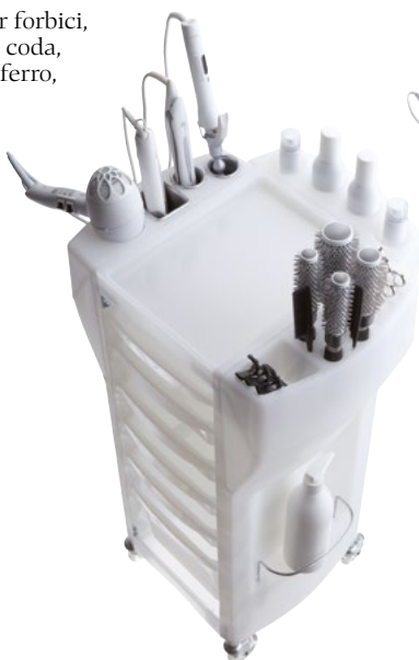
Bianco / White