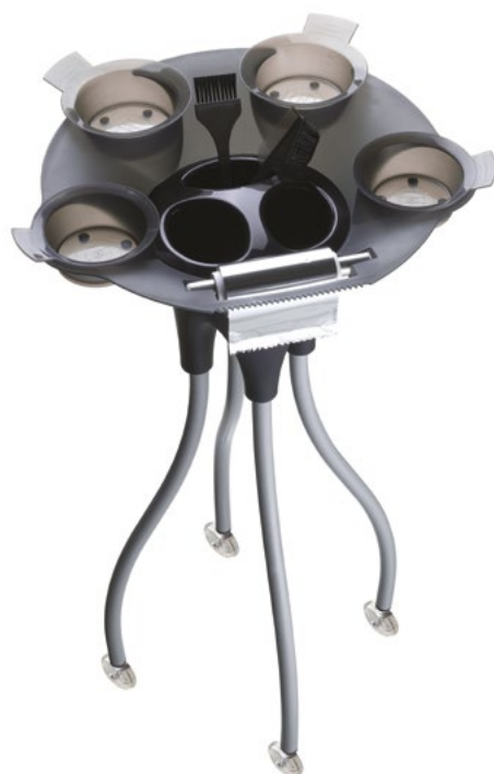
Nero / Black