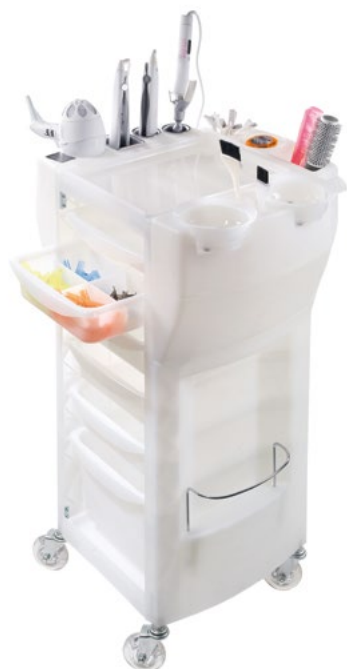
Bianco / White