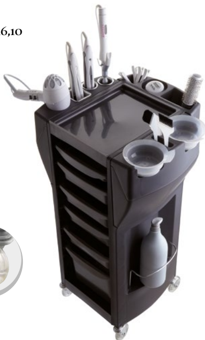
Grigio scuro / Dark grey