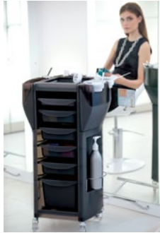
Upgrade Styling / Upgrade Colouring