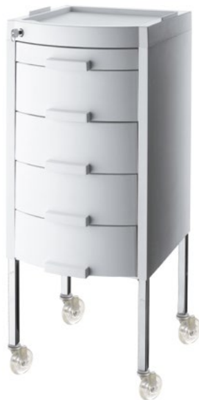
Bianco / White