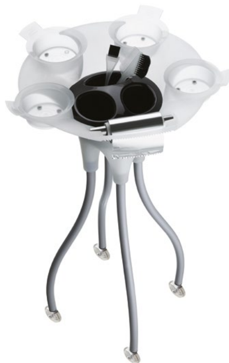
Bianco e nero / White and black