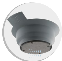
Sistema magnetico Magnetic system