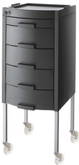
Nero / Black