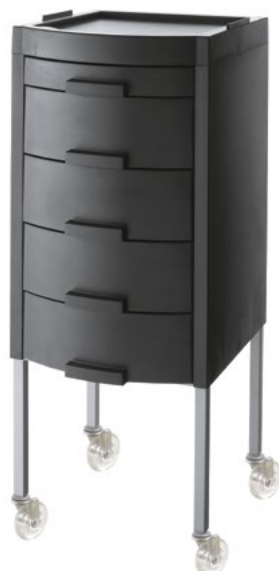
Nero / Black