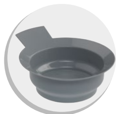
2 ciotole incluse 2 bowls included

Magnetic service folding trolley with 2 bowls included.