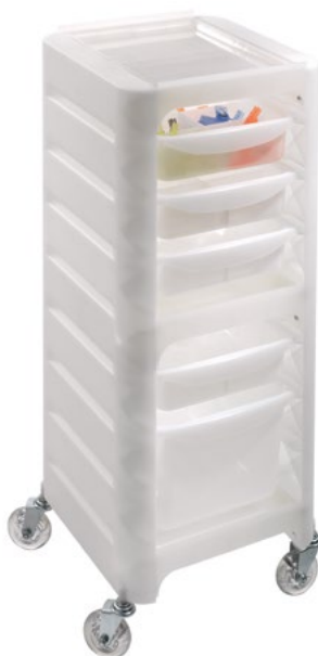
Bianco / White