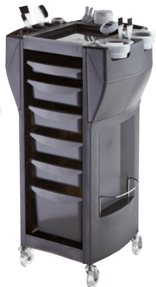
Grigio scuro / Dark grey