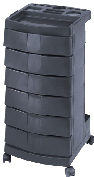
Grigio scuro / Dark grey

Professional trolley, dark grey plastic structure. Professional top. 6 removable drawers. Hair-free Gonzales wheels.