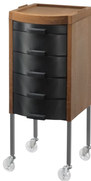
Nero / Black