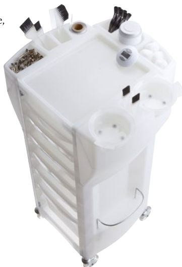
Bianco / White