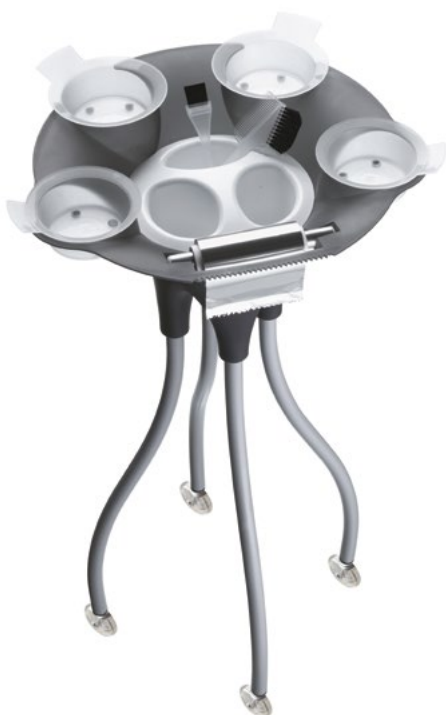
Nero e bianco / Black and white