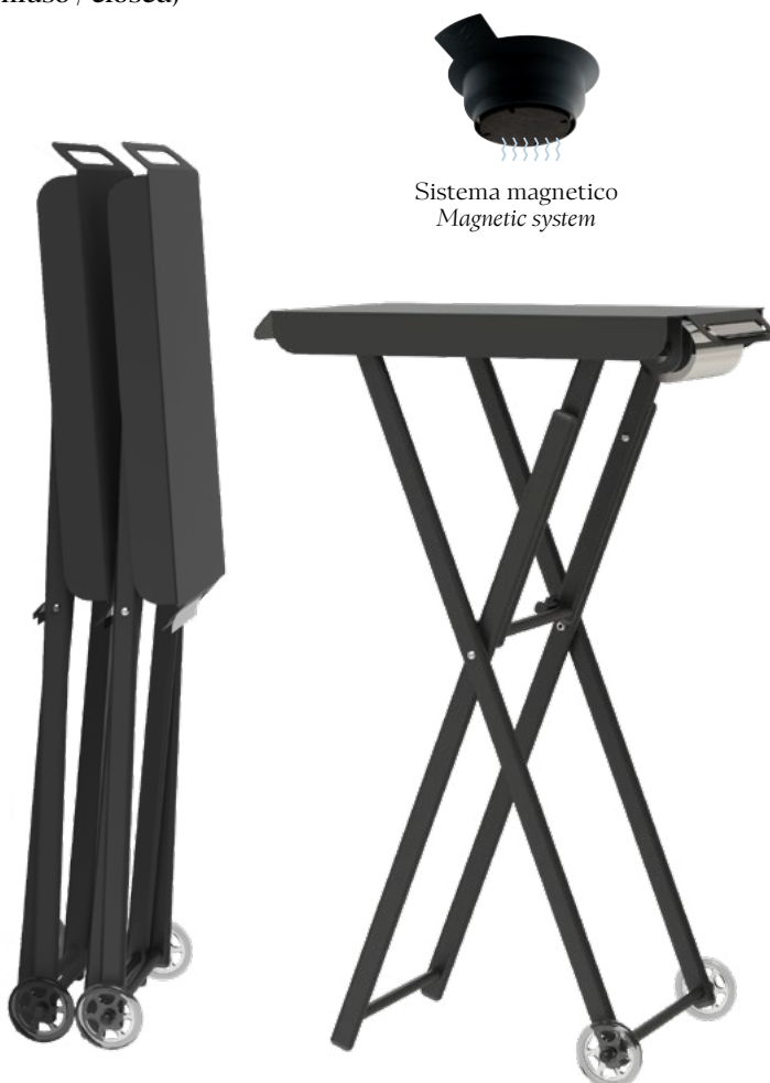
Sistema magnetico Magnetic system