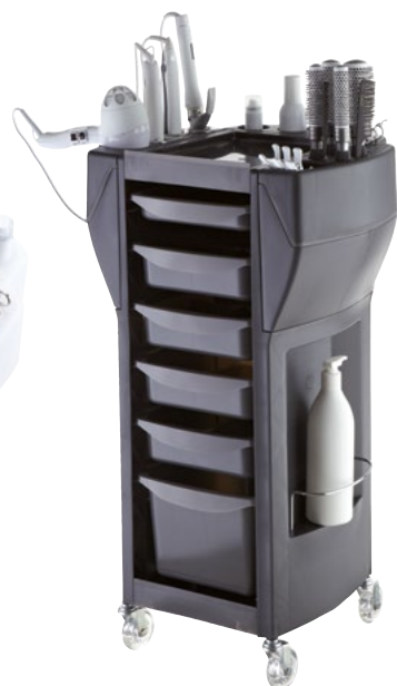
Grigio scuro / Dark grey