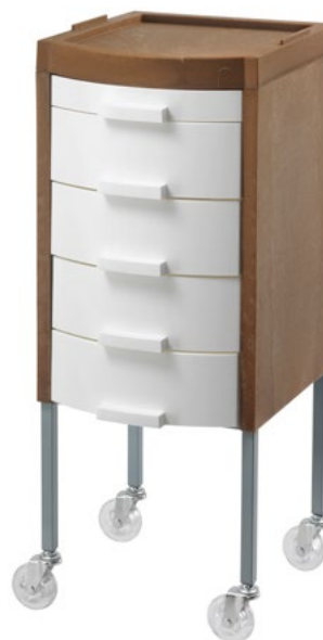
Bianco / White